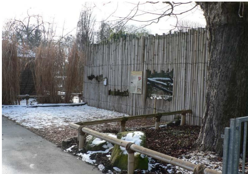
Visitors view at Heidelberg Zoo

To keep more than one Asiatic golden cat, a second enclosure is necessary to separate individuals for longer periods. Both enclosures should be connected by fine-meshed wire with two sliding doors, so that cats can change enclosures by rotation.