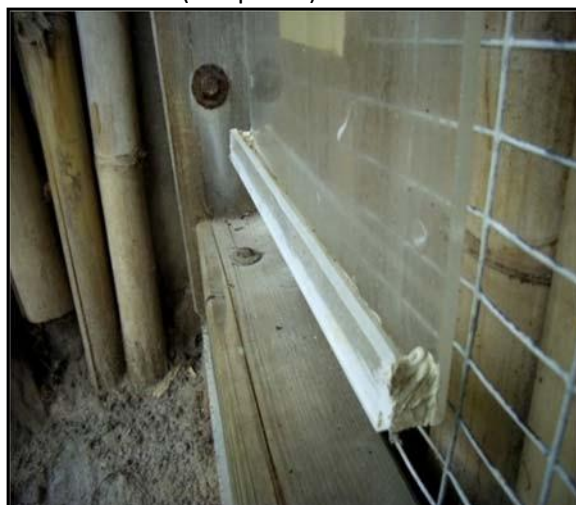
Plastic plate for urine samples

Easy and stress free sampling of the urine can be done with a special designed plastic plate. When the cat urinates against the plate, the urine goes down into the basin where it can be sucked into a syringe for examination (see photo).