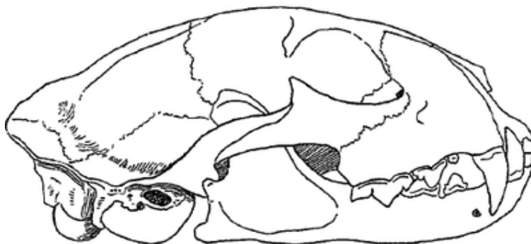
Skull of adult Catopuma temminckii

With a body weight of 8-16 kg Catopuma temminckii ranks among the medium-sized wild cats with a considerable sexual dimorphism in size. Females usually weigh 8-10 kg, whereas adult males mostly have a weight of 12 – 15 kg. The total length differs between 110 and 160 cm whereas the tail represents one third of the total body length.