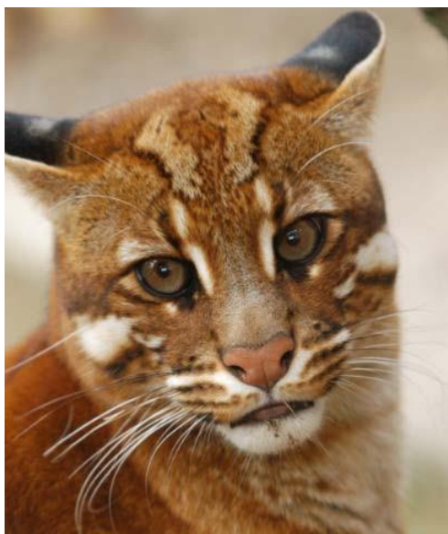
C. temminckii at Heidelberg Zoo

The fur is mostly fox-red to golden brown or gray with a brighter underpart with some dark spots. But black individuals or color variants with ocelot-like rosettes and spots are also known, especially from the northern part of the range. The ears are small and rotund. The back of the ears are black with grizzled centers. The face of the Asiatic golden cat is marked with white and black lines running across its cheeks and from one corner of the eyelid up to the top of its head. On the ventral side of the tail is a white streak, which is easily visible towards the terminal part of the tail.