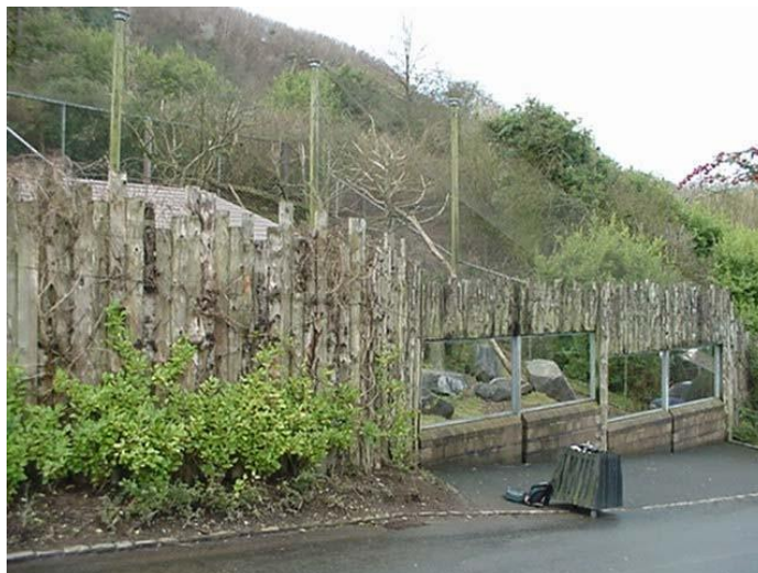
Visitors view at Belfast Zoo