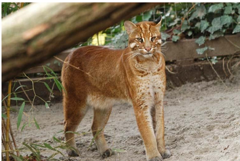
C. temminckii at Heidelberg Zoo