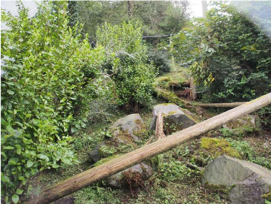
Outdoor enclosure Belfast Zoo

In the wild Asiatic golden cats live in a wide range with different habitats and climates. Northern populations can be found in colder habitats up to over 3000 m altitude, whereas golden cats in southern range occur in tropical lowland forests. The animals in captivity origin from different parts in the wild. Although Asiatic golden cats are rather adaptable to different climates and seems to be tolerant of colder temperatures, individuals in captivity should have access to an indoor enclosure or frost-protected areas, most suitable with temperatures not under 10 degrees. Indoor and outdoor enclosures should be equipped with several wooden boxes of ca. 70 cm wide, 50 cm deep and 40 cm high, which are used by the cats for breeding, but also to retire into and for sleeping, and sometimes as a toilet. Boxes should have a cover, which can be opened by the keepers, a hole of 25 cm in diameter as an entrance for cats and should be filled with wooden chips or shavings. A partition, which excludes light and draughts, provides additional seclusion for the animals (see Figure1).