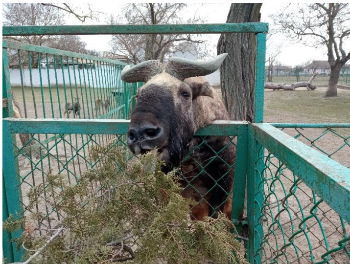
Figure 3: Shelter and food for animals in Askania Nova Reserve

The Fund remains open however, the majority has now been spent out. Calls for donations will continue and EAZA remains committed to supporting zoos and aquariums in Ukraine care for their animals and staff.