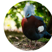
Pigeon and Dove