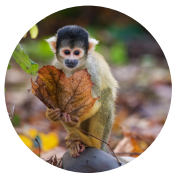
Larger New World Monkey