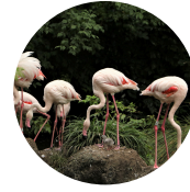
Ciconiiformes and Phoenicopteriformes