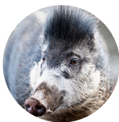
Tapir and Suiform