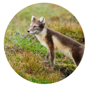
Canid and Hyaenid