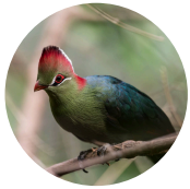
Toucan and Turaco