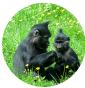
Afro Eurasian Monkey