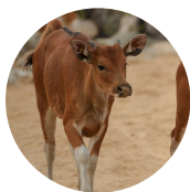
Cattle and Camelid