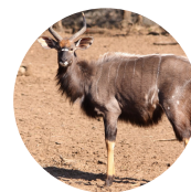
Antelope and Giraffid