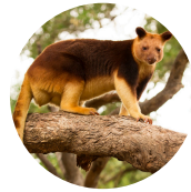
Monotreme and Marsupial